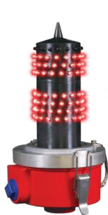
AIRCRAFT WARNING LIGHTS