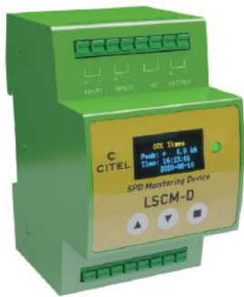
LIGHTNING SURGE CURRENT COUNTER