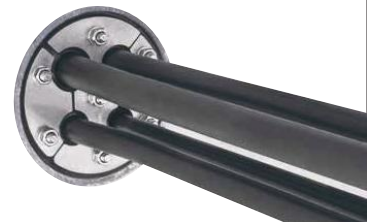
MULTI CABLES-PIPES TRANSIT SEALING SYSTEMS