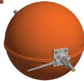
CONDUCTOR MARKING SPHERES